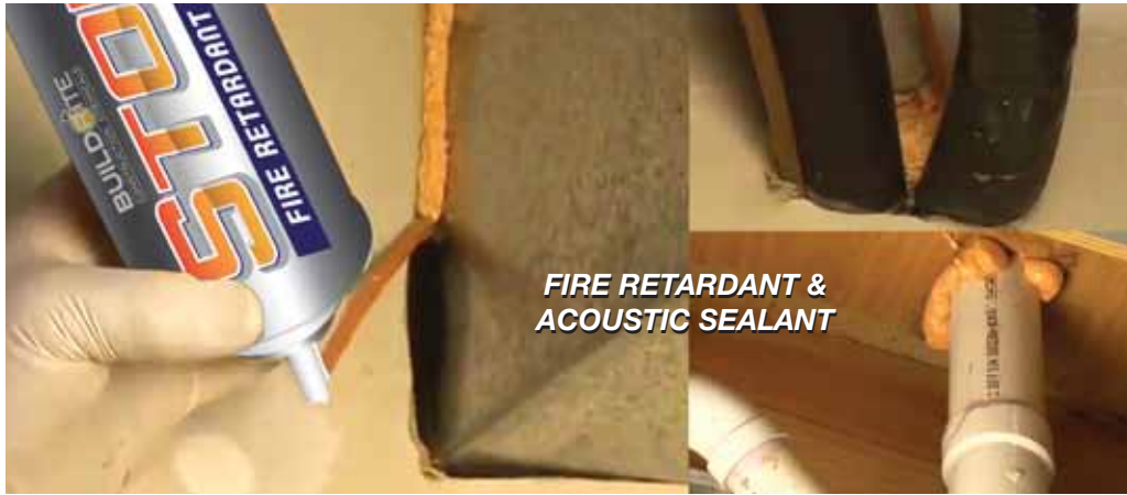
FIRE RETARDANT & ACOUSTIC SEALANT