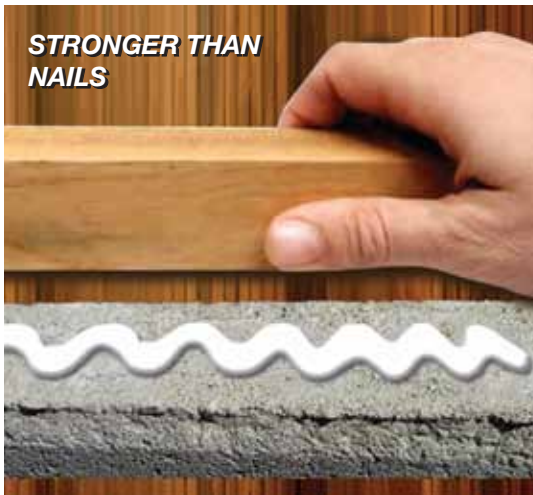
STRONGER THAN NAILS