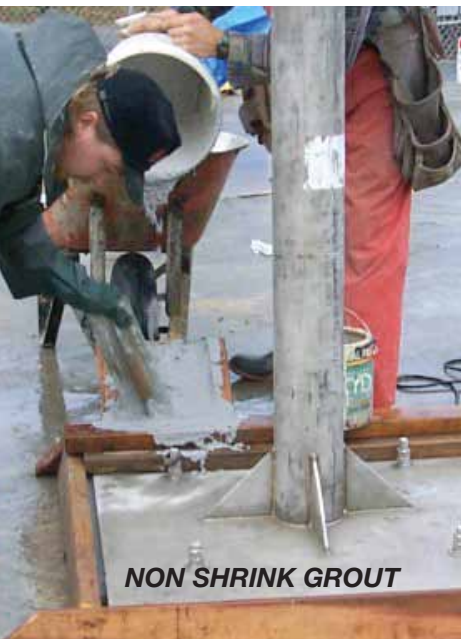
NON SHRINK GROUT